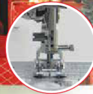
AcuFeed™ Flex Plus Fabric Feeding