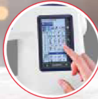
Touch Screen with 13 Languages