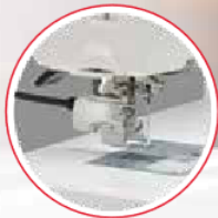
A.S.R.™ (Accurate Stitch Regulator) Compatible (Optional)