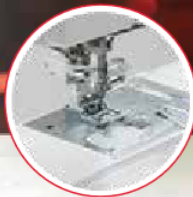
AcuFeed™ Flex Layered Fabric Feeding System