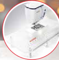
Extra-wide Extension Table Included