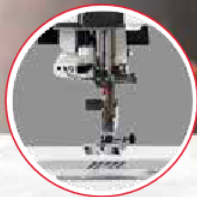
Superior Needle Threader 2