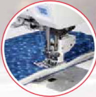
AcuFeed™ Flex Fabric Feeding System