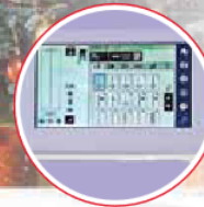
7" Color LCD Touchscreen