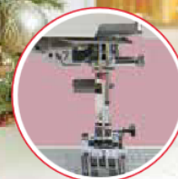
Enhanced Superior Needle Threader 2