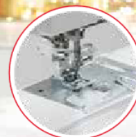
AcuFeed™ Flex Layered Fabric Feeding System