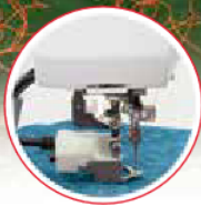
A.S.R.™ (Accurate Stitch Regulator)