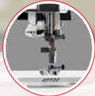
Superior Needle Threader 2