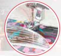
Ruler Quilting Function