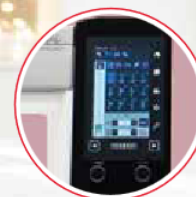
Hi-Definition 5" LCD Color Touchscreen

The Horizon Memory Craft 9410QC features 300 built-in stitches, 11 one-step buttonholes, enhanced Superior Needle Threader 2, and a maximum sewing speed of 1,060 stitches per minute.