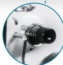
Easy-Set Tension ™