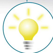
QuiltMaster ™ LED lighting: throat, needle, and bobbin