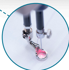
Pinpoint needle laser