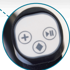
Independently-adjustable handlebars with programmable buttons