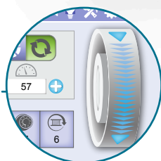
On-screen hand wheel

Twenty-four inches of quilting possibilities.