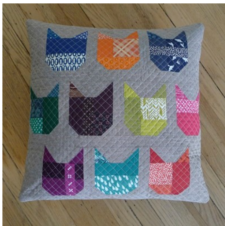
March: Kitty Cat Pillow