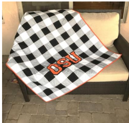
January: Buffalo Plaid Throw