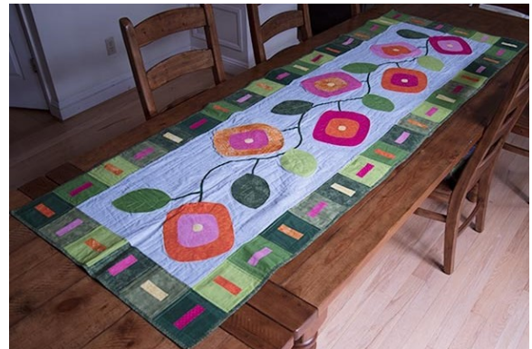
February: Flower Pops Table Runner