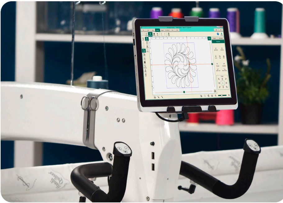
Pro-Stitcher Premium shown on one of many compatible machines.