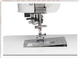
Computerized One-Touch Needle Plate Conversion

Expand your Horizons with the Continental M7 sewing machine and experience several industry firsts that give you the features you'll wonder how you ever lived without.