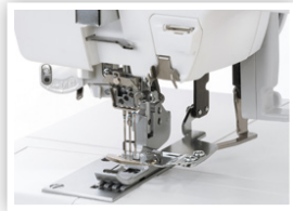
Built-in top cover stitch guide