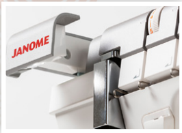
Retractable Sewing Light