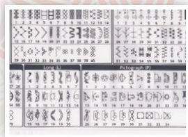
350 Built-In Stitches