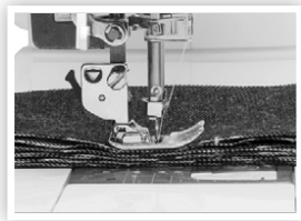
Easily tackle heavyweight, home decor fabrics