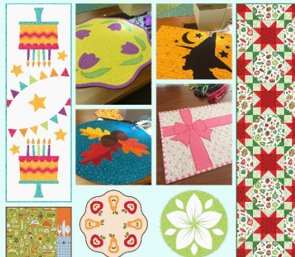
Here are some examples of the types of projects you'll receive when you join. Each month is a surprise.

An added bonus for those who are machine embroiderers or use digital cutters: We will also include the machine embroidery files and SVG cutting files for any project that includes Patrick's trademark fusible applique designs, at no additional charge.