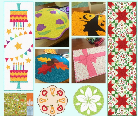
Here are some examples of the types of projects you'll receive when you join. Each month is a surprise.

An added bonus for those who are machine embroiderers or use digital cutters: We will also include the machine embroidery files and SVG cutting files for any project that includes Patrick's trademark fusible applique designs, at no additional charge.