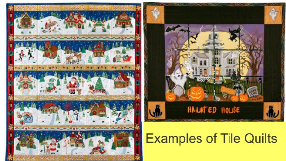
Examples of Tile Quilts

This class is about learning the technique of using Tile Designs to make a quilt.