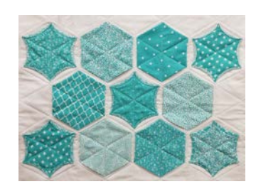
August Teal Designs