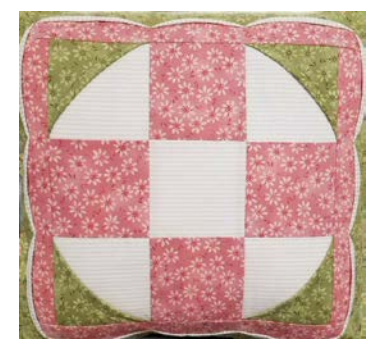
June Scallop Frames

Class Cost $15 Kit Fee: $15 paid to instructor at time of class Kit includes everything to complete the top of the pillow. Kit does not include pillow form or backing.