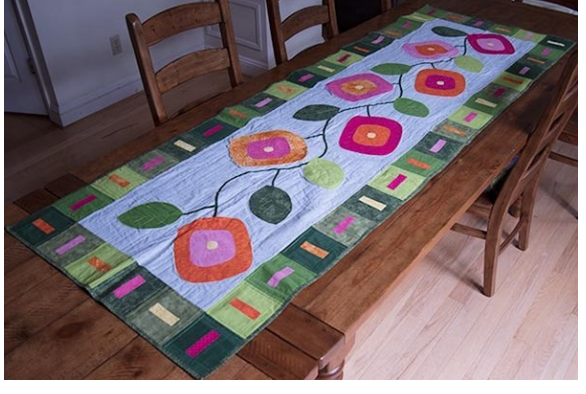
February: Flower Pops Table Runner