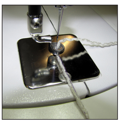
(Continue at the top of column 3.)

Either use a tooth floss threader to thread the couching foot, or lay the fiber to be couched over the top of the couching foot and take several tacking stitches to push the fiber through the hole; then pull the short, loose end of the fiber through the hole in the couching foot.