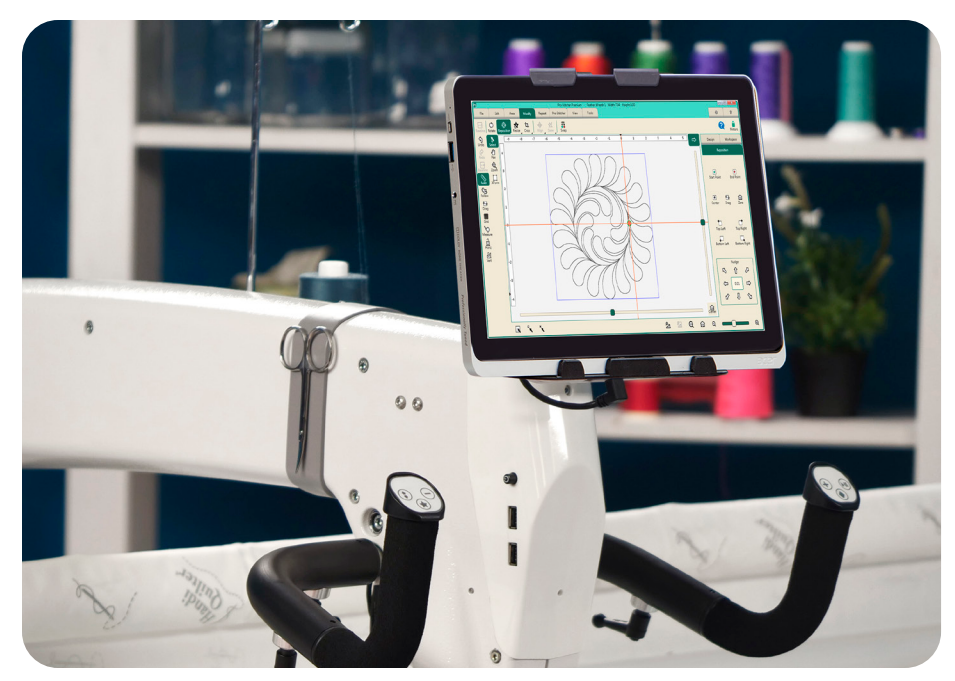
Pro-Stitcher Premium shown on one of many compatible machines.