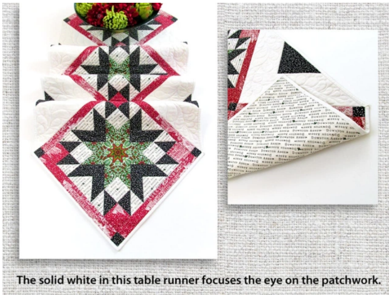
The solid white in this table runner focuses the eye on the patchwork.